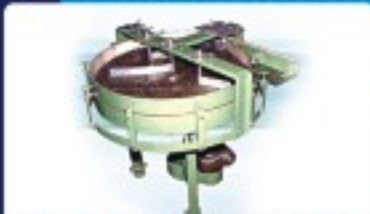
Bearing ring feeding system