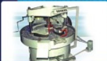
Ball lapping Machine