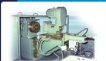
Multi Pocket Boring Machine