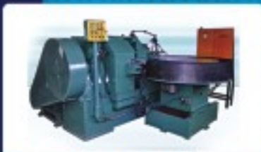
Ball Grinding Machine